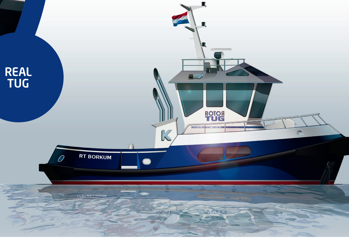
ARTIST IMPRESSION ART 10-15 TTC TRAINING TUG RT BORKUM

Numerous ports and operators in various regions like the Middle East, Africa and Europe have already benefitted from our cost-efficient solutions. For example we have helped LNG terminals to increase their uptime by providing Terminal Outage Prevention Training, provided port authorities with cost-effective advice for optimal lay-out and advised operators on the best tug configuration. Please visit our website www.tugtraining.com for a more detailed overview of successfully completed projects and assignments.